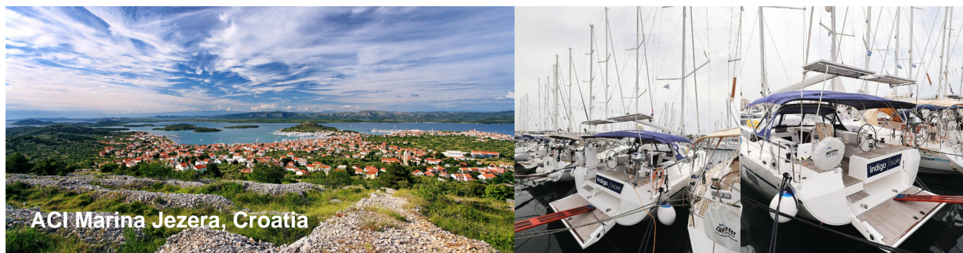
ACI Marina Jezera, Croatia