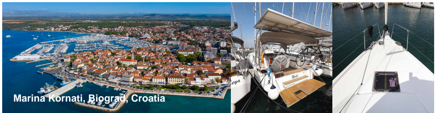
Marina Kornati, Biograd, Croatia