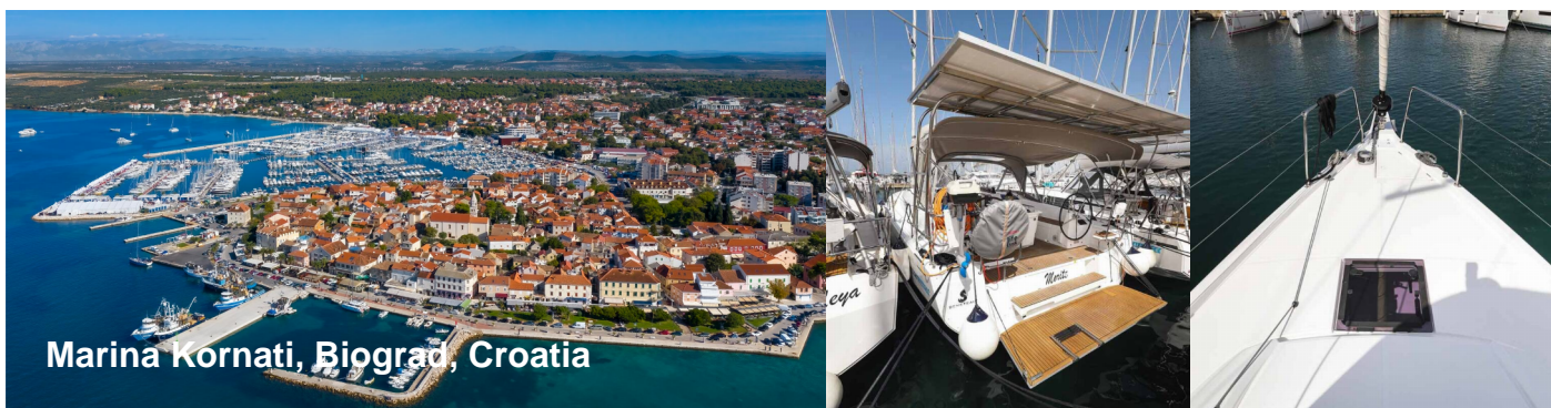
Marina Kornati, Biograd, Croatia