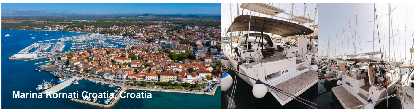
Marina Kornati Croatia Croatia