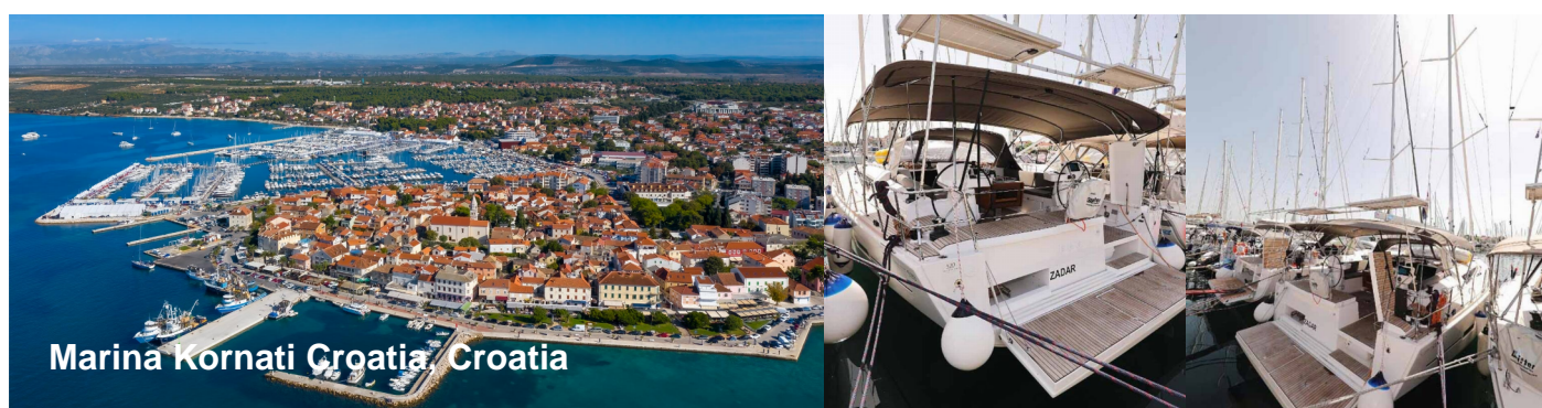
Marina Kornati Croatia Croatia