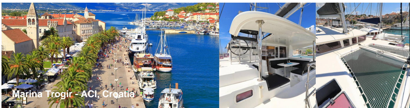
Marina Trogir - ACI, Croatia