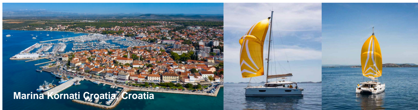
Marina Kornati Croatia Croatia