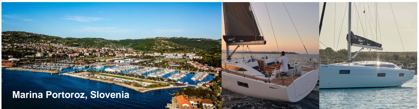
Marina Portoroz, Slovenia