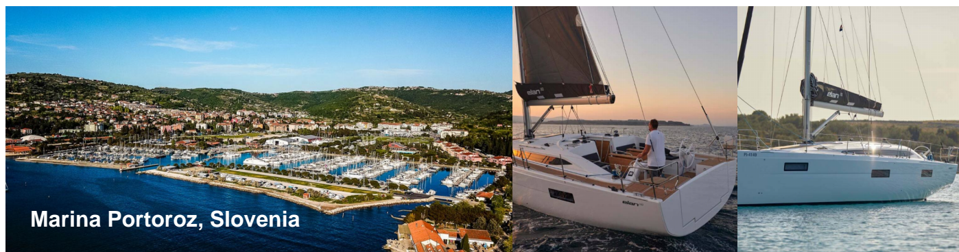
Marina Portoroz, Slovenia