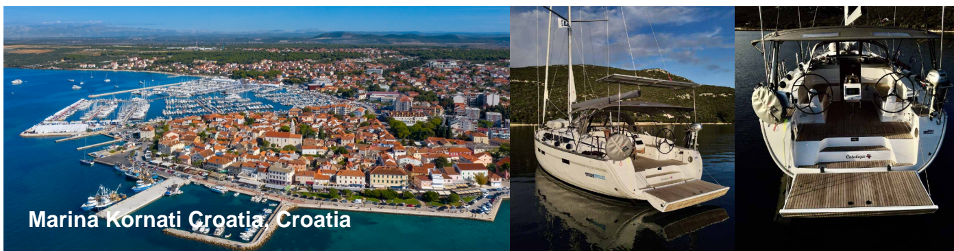
Marina Kornati Croatia Croatia