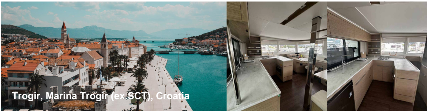
Trogir, Marina Trogir (ex-SCT), Croatia