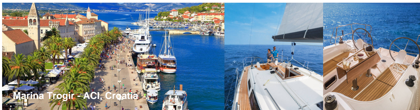
Marina Trogir - ACI, Croatia