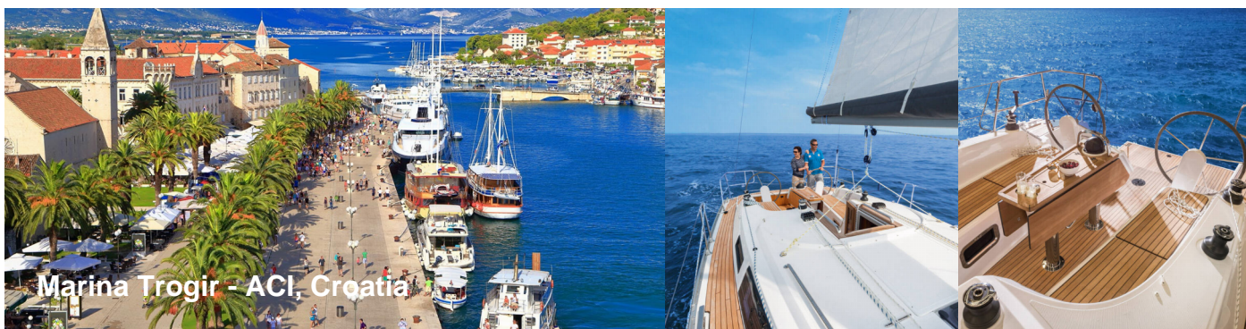
Marina Trogir - ACI, Croatia