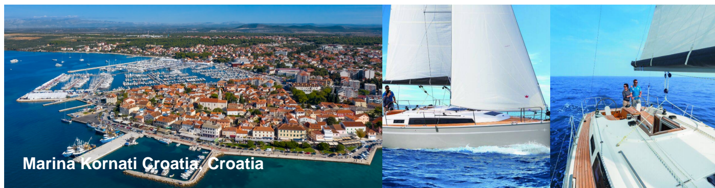
Marina Kornati Croatia Croatia