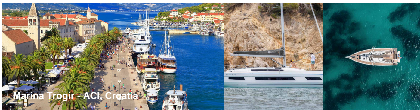
Marina Trogir - ACI, Croatia