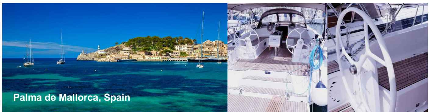
Palma de Mallorca, Spain