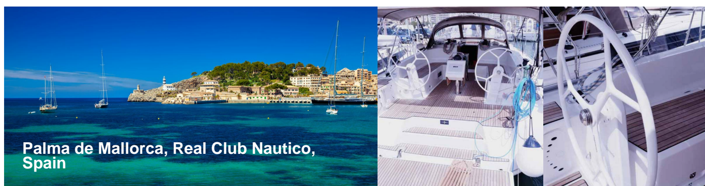
Palma de Mallorca, Real Club Nautico, Spain