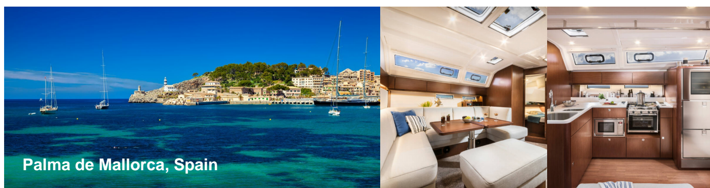
Palma de Mallorca, Spain