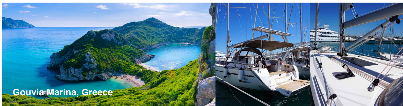
Gouvia Marina, Greece