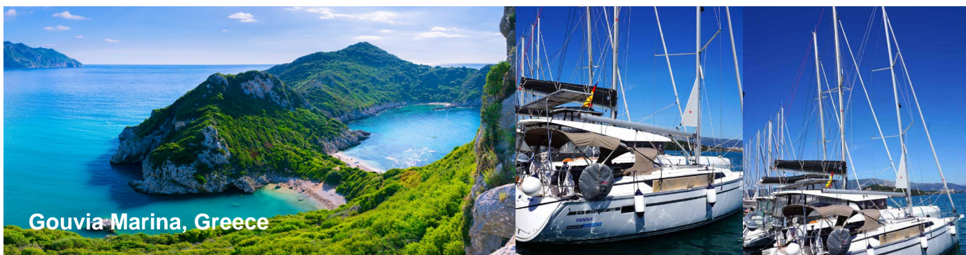
Gouvia Marina, Greece