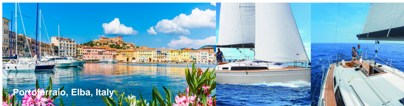
Portoferraio, Elba, Italy