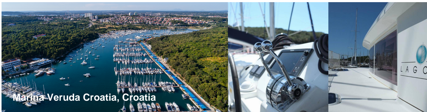
Marina Veruda Croatia, Croatia