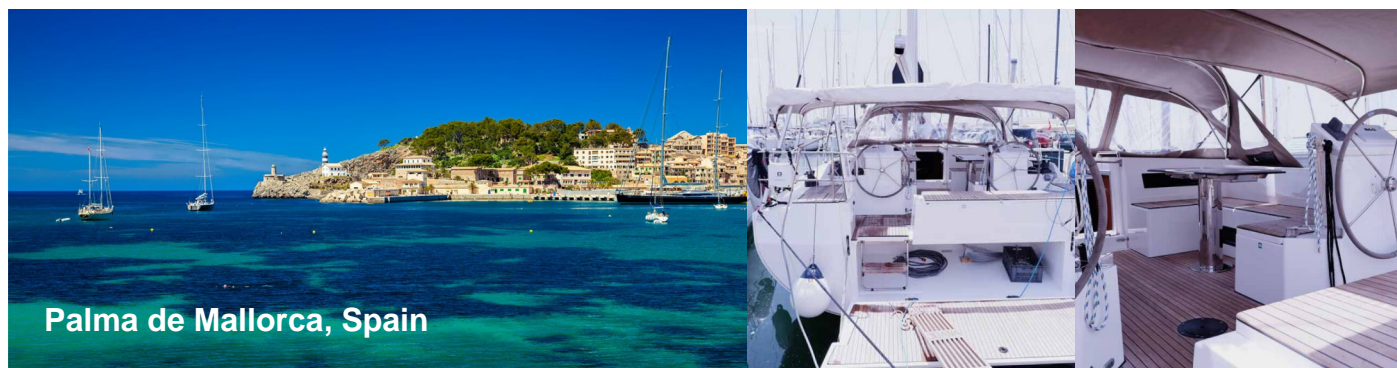
Palma de Mallorca, Spain