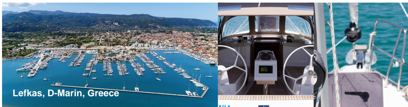
Lefkas, D-Marin, Greece