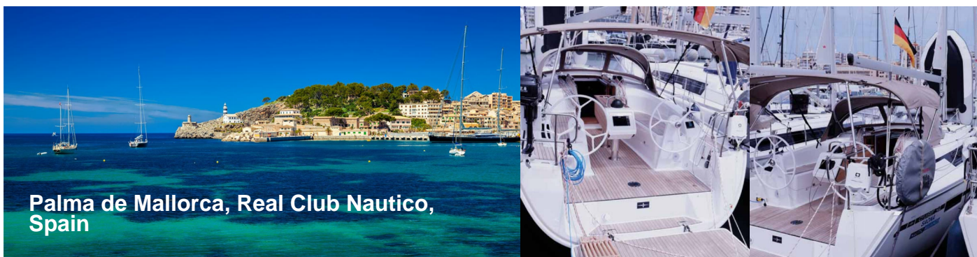
Palma de Mallorca, Real Club Nautico, Spain