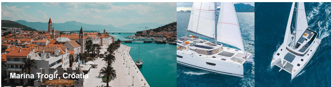
Marina Trogir, Croatia