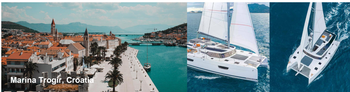
Marina Trogir, Croatia