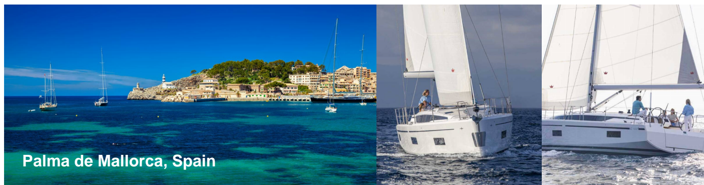
Palma de Mallorca, Spain