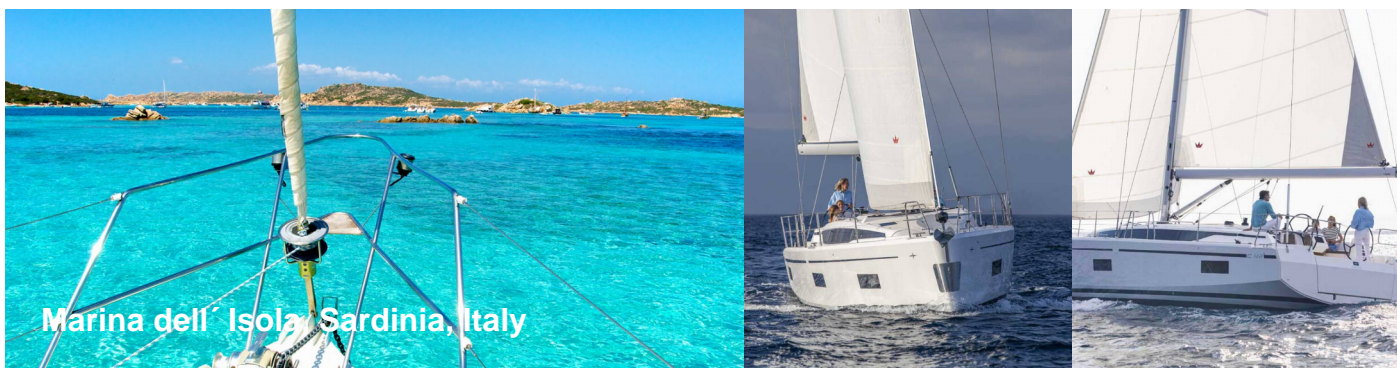
Marina dell' Isola Sardinia, Italy