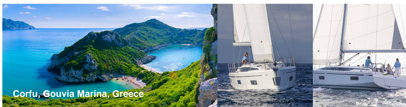
Corfu, Gouvia Marina, Greece