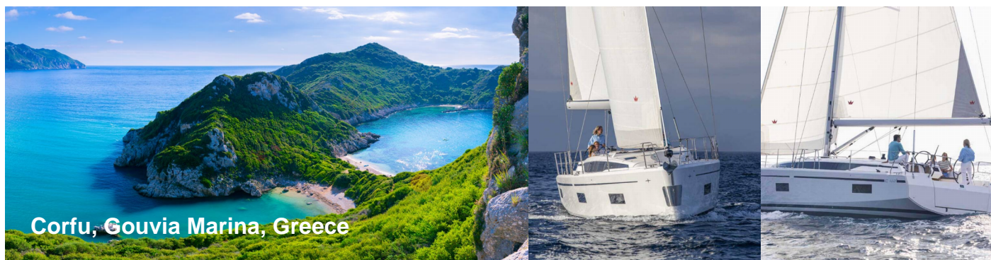
Corfu, Gouvia Marina, Greece