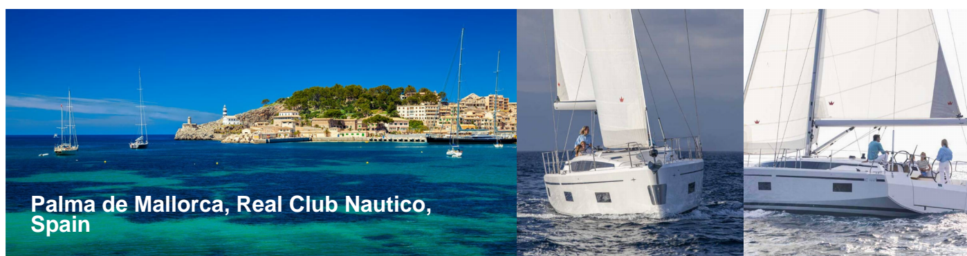
Palma de Mallorca, Real Club Nautico, Spain