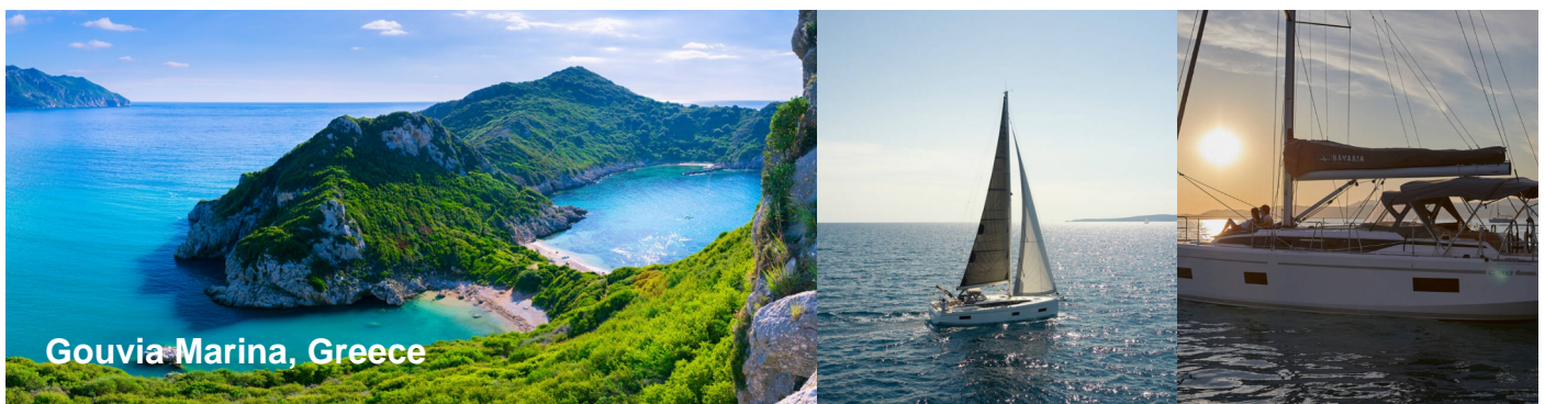
Gouvia Marina, Greece