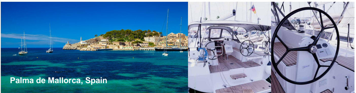
Palma de Mallorca, Spain