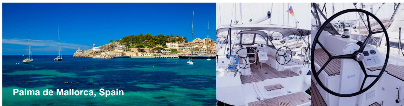
Palma de Mallorca, Spain