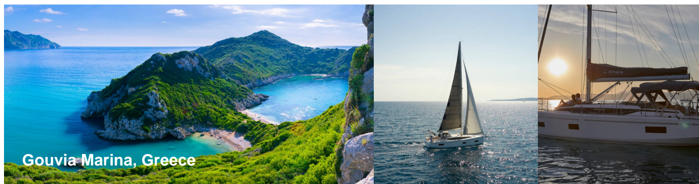
Gouvia Marina, Greece