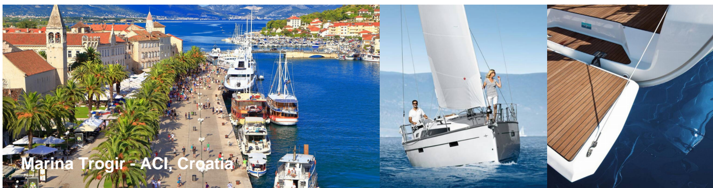
Marina Trogir - ACI, Croatia