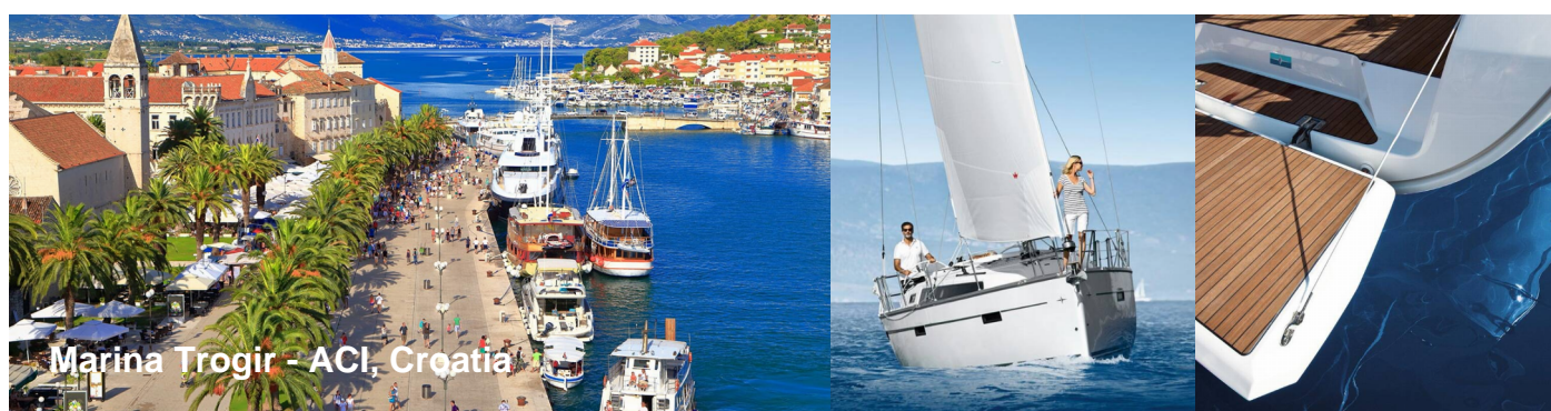
Marina Trogir - ACI, Croatia