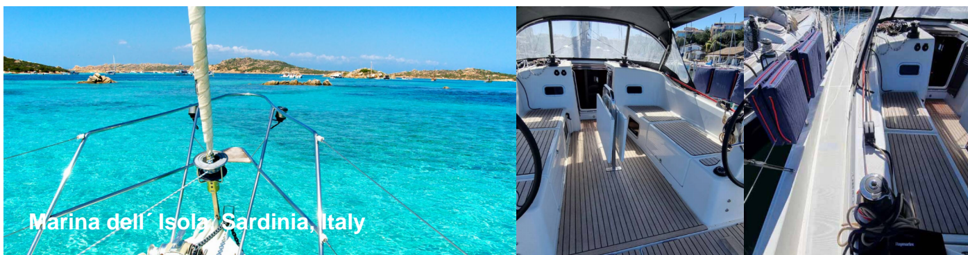
Marina dell' Isola Sardinia, Italy