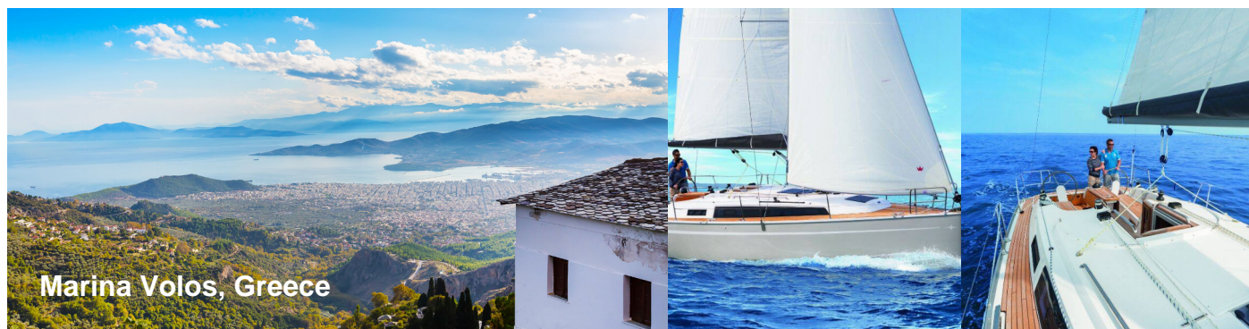
Marina Volos, Greece