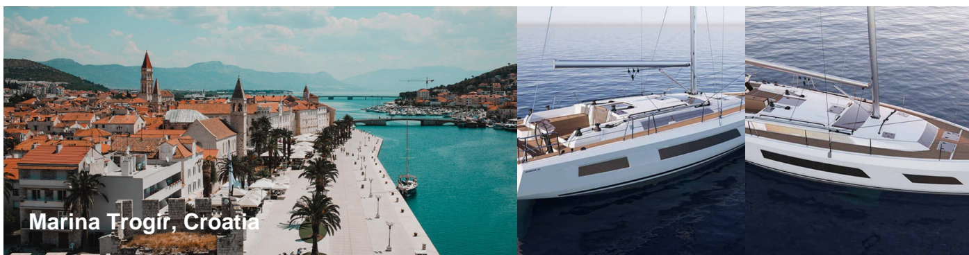
Marina Trogir, Croatia