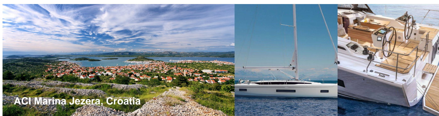
ACI Marina Jezera, Croatia