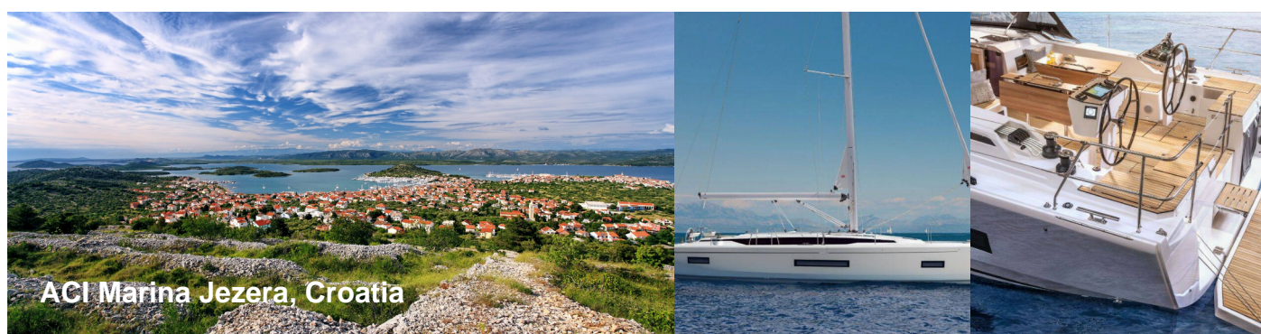
ACI Marina Jezera, Croatia