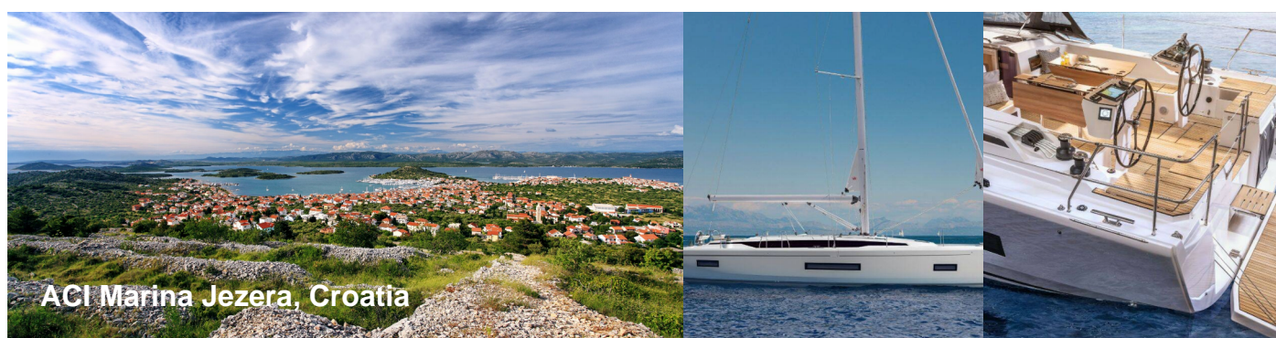
ACI Marina Jezera, Croatia