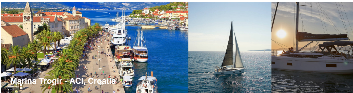
Marina Trogir - ACI, Croatia