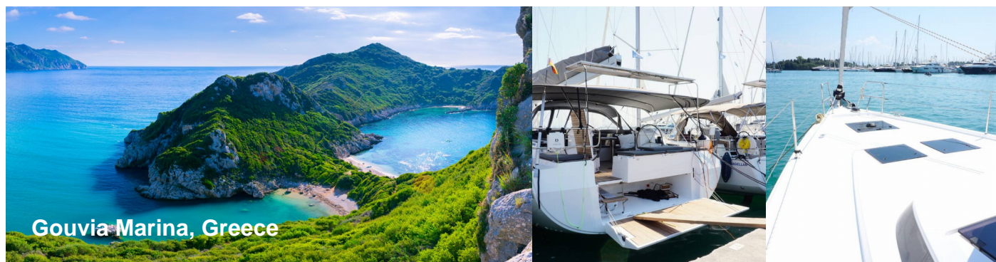
Gouvia Marina, Greece