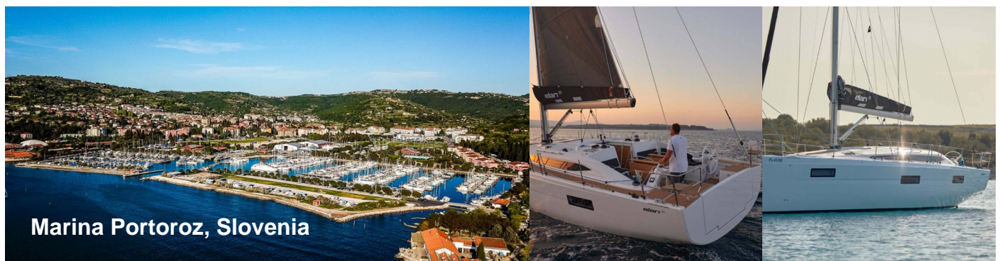
Marina Portoroz, Slovenia