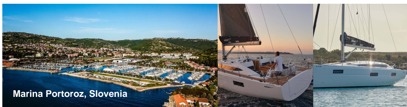
Marina Portoroz, Slovenia