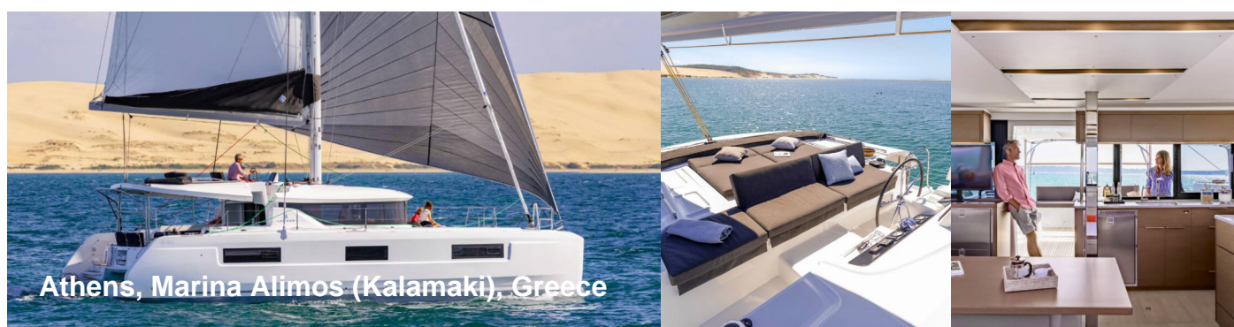
Athens, Marina Alimos (Kalamaki), Greece