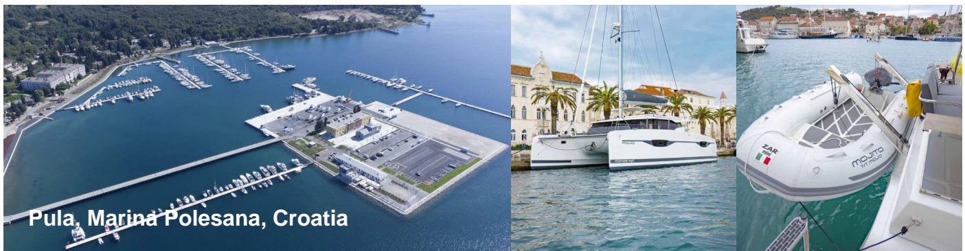
Pula, Marina Polesana, Croatia