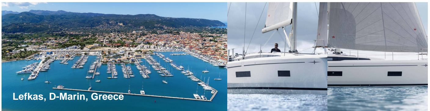
Lefkas, D-Marin, Greece