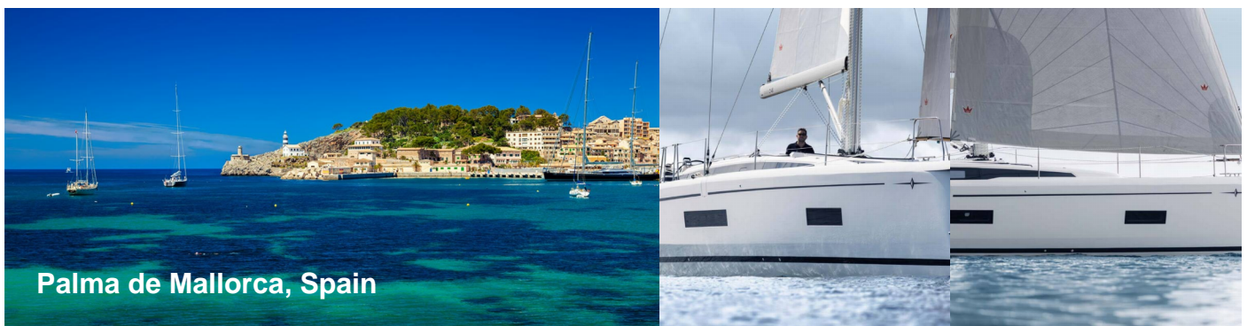
Palma de Mallorca, Spain