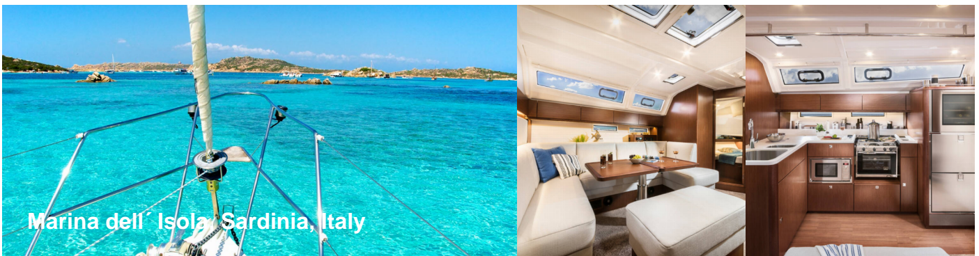
Marina dell' Isola Sardinia, Italy