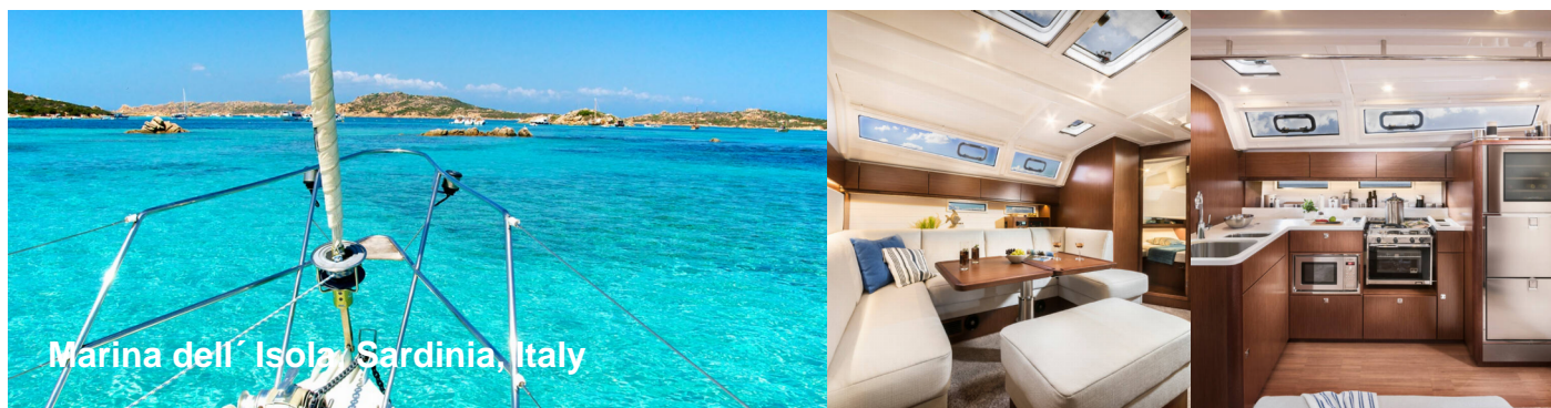
Marina dell' Isola Sardinia, Italy