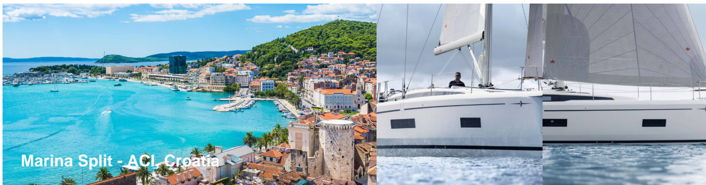
Marina Split - ACI Croatia