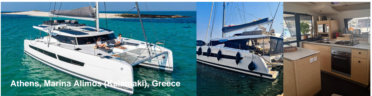
Athens, Marina Alimos (Kalamaki), Greece