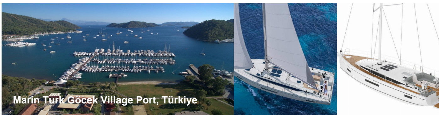
Marin Türk Göcek Village Port, Türkiye