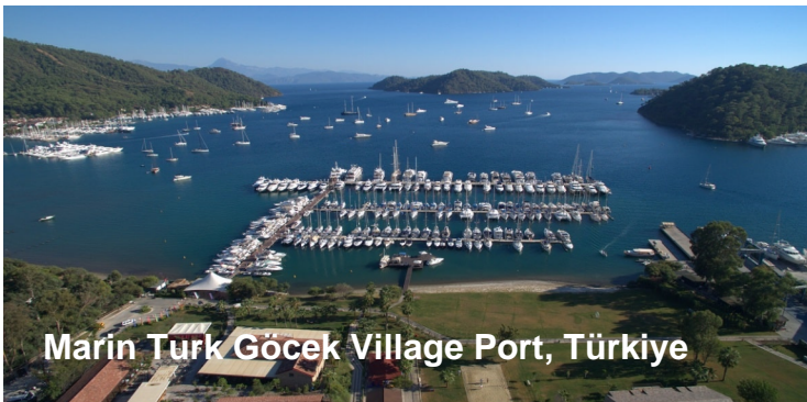
Marın Türk Göcek Village Port, Türkiye