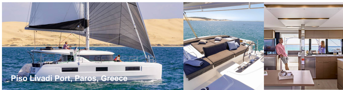
Piso Livadi Port, Paros, Greece