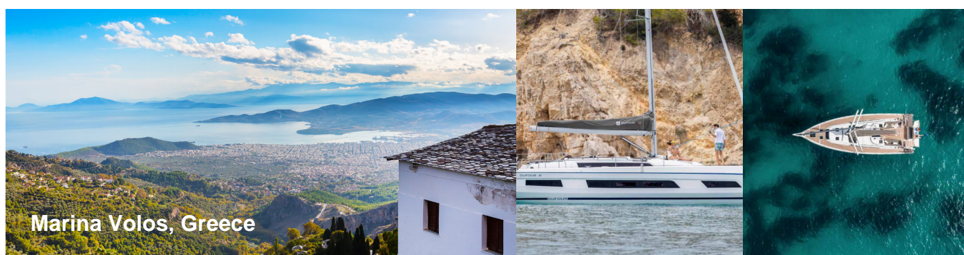
Marina Volos, Greece