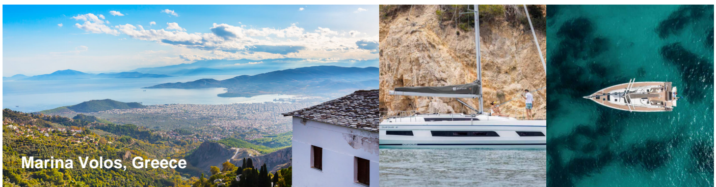
Marina Volos, Greece