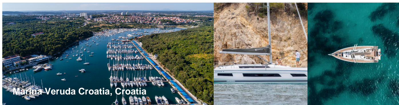
Marina Veruda Croatia, Croatia