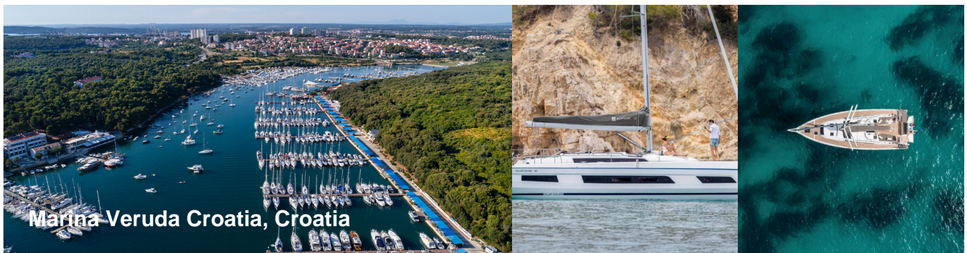
Marina Veruda Croatia, Croatia