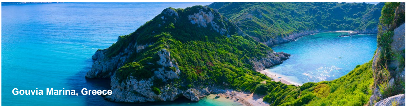
Gouvia Marina, Greece