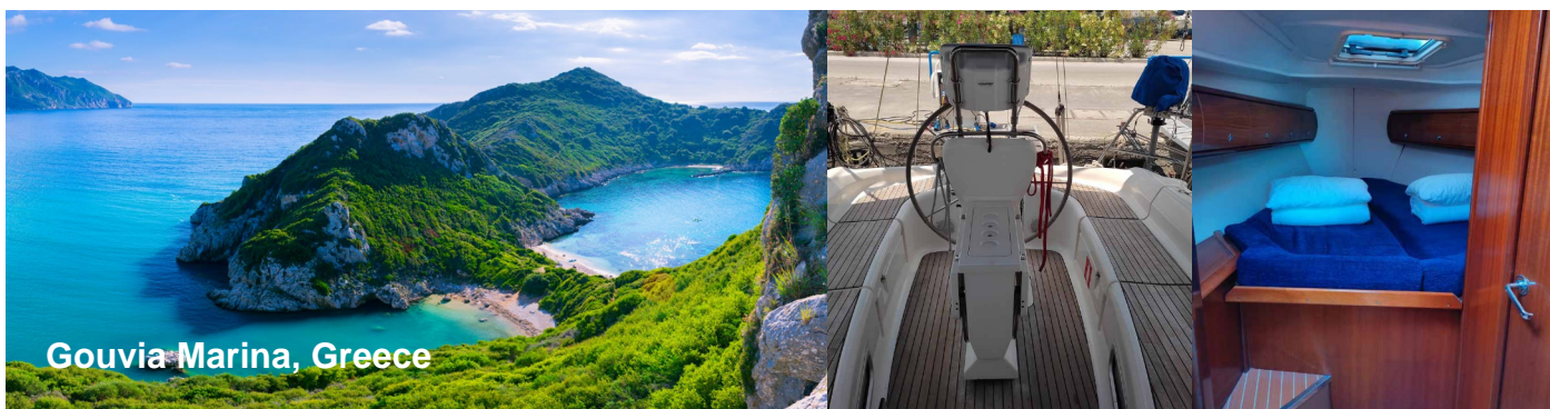
Gouvia Marina, Greece