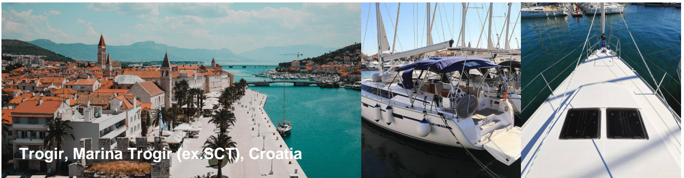
Trogir, Marina Trogir (ex-SCT), Croatia