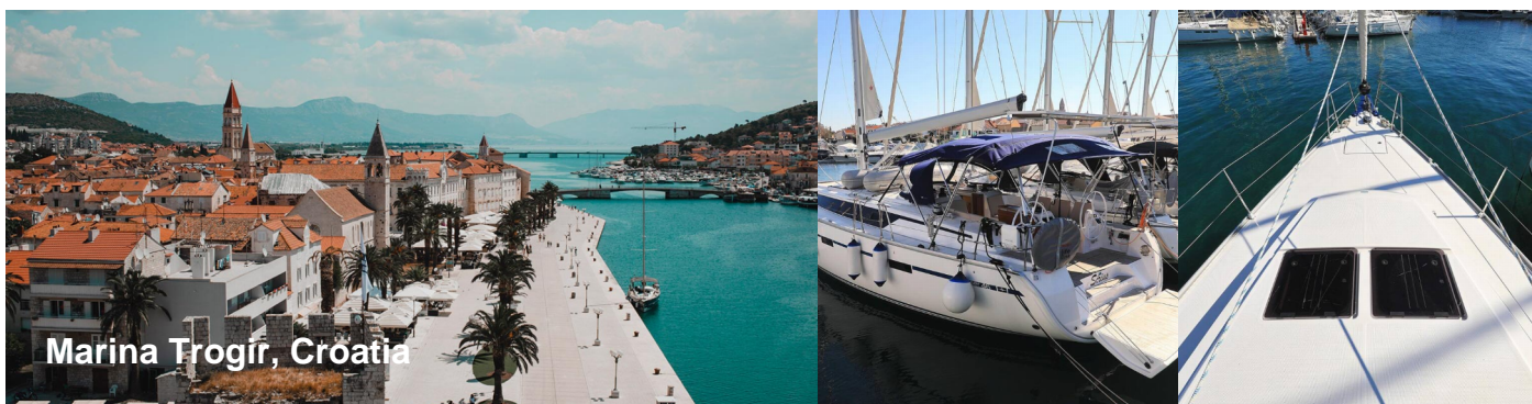
Marina Trogir, Croatia