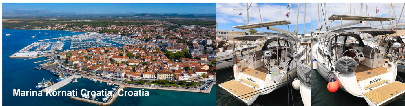
Marina Kornati Croatia Croatia